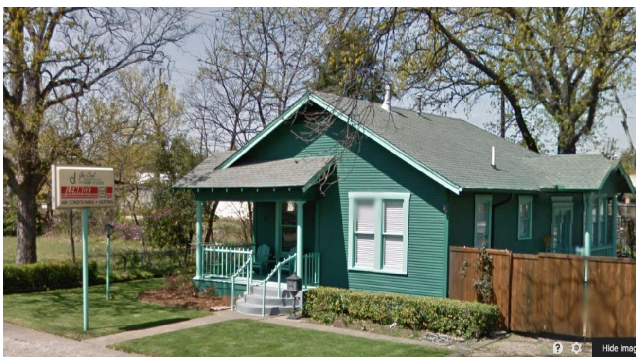
Joe Cook Heating and Air Conditioning – located on Avenue A, just off Main Street in the proposed Walkable Main Street neighborhood of Garland Texas