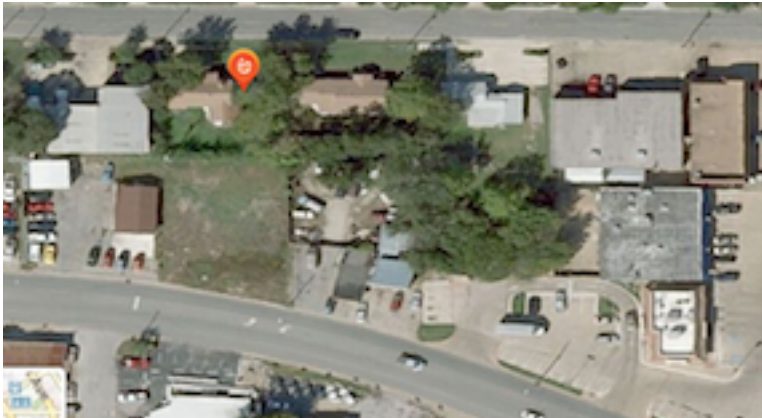
Photo below shows a bird's eye view of its relationship to a vacant lot on Main Street behind the house. Main Street is the street that curves near the bottom of the photo. (Note: that lot may have a small building on it now. This may be that new brick building that is for lease with two spaces, one 1,800 and the other 600 square feet. I'll have to check. If not this might provide an access from State to parking on Main for the nearby businesses.)

Small white home 965 square feet, 2 bedroom 1 bath valued at $56,100. 8,329 square foot lot. Built in 1933. A lot of the homes along this street appear to have been built in 1933.